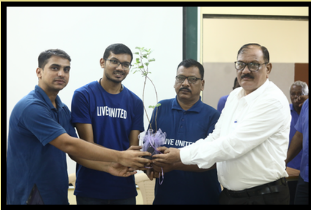
TRAINING ON HELMET