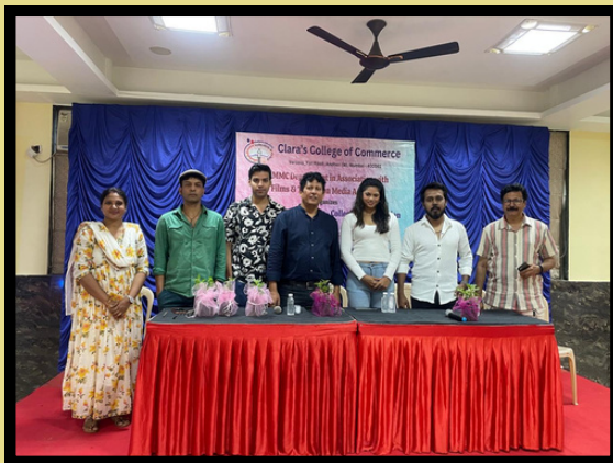
MEDIA MASH UP